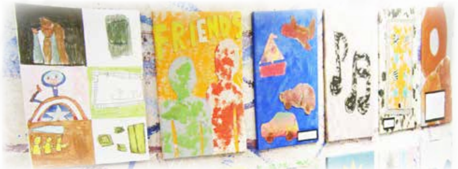
Artwork by Derbyshire schoolchildren

AJM Healthcare is currently working with different groups and schools to create community projects. This provides an alternative route of expression and helps us to connect with the community.